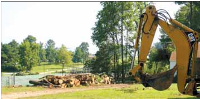
Land is being cleared for the new science center at Christchurch School.