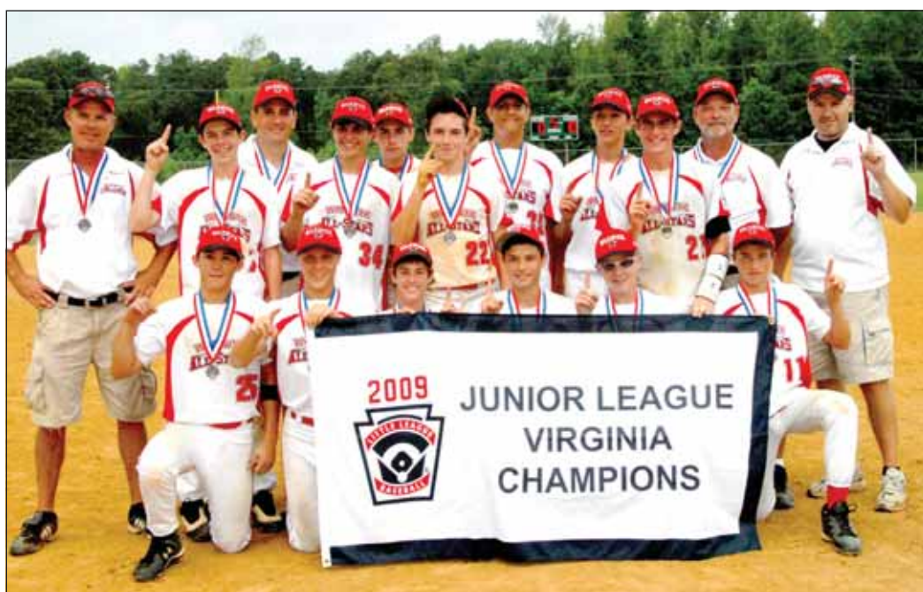
Warwick proudly displays its championship banner after shutting out Danville 10-0 in the championship game of the Junior Little League State Tournament at the Middlesex Sports Complex Wednesday afternoon. The state tournament was hosted by the Middlesex Little League and District 15.