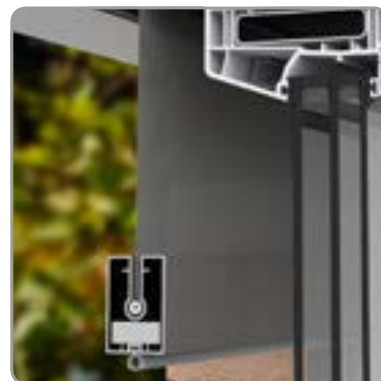
Detail bottom bar (integrated seam)