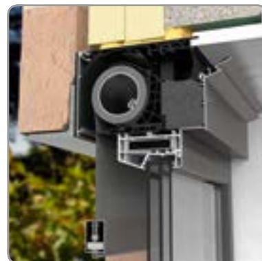
Inner view Fixvent® Mono AK EVO