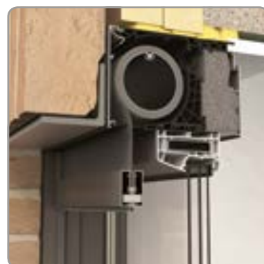
Outer view Fixscreen® Mono AK EVO