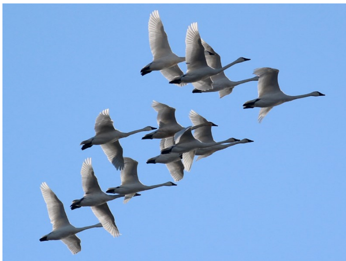
Tundra Swans