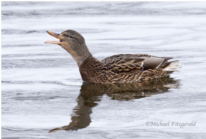
Female Mallard