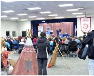
Bald Eagle Days at Clinton Community College