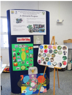
Jr. Stewards Project "Circle of Life"