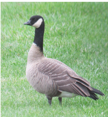
Cackling Goose

Bald Eagle viewing trip we do is new and different. You never know what you might see when you are really looking. If you have cabin fever this winter please join us on one of our tours. Spending some time with nature and the wonders that surround us really will help to get through the long days of winter. Soon those long winter days will turn into Spring and new opportunities to add to your birding list! Happy Birding!