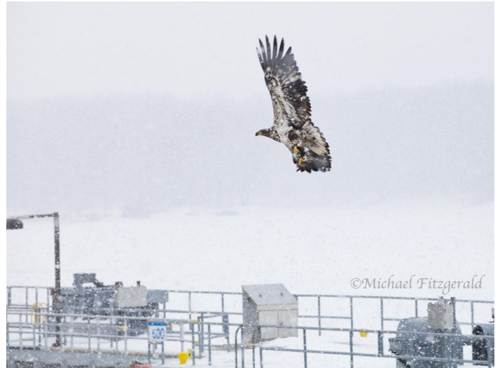
Immature Bald Eagle at Lock and Dam 13