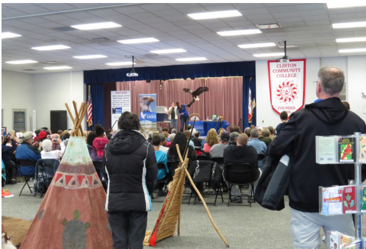
The National Eagle Center Program

Date For Next Years 31st Bald Eagle Days is Jan. 10th 2015