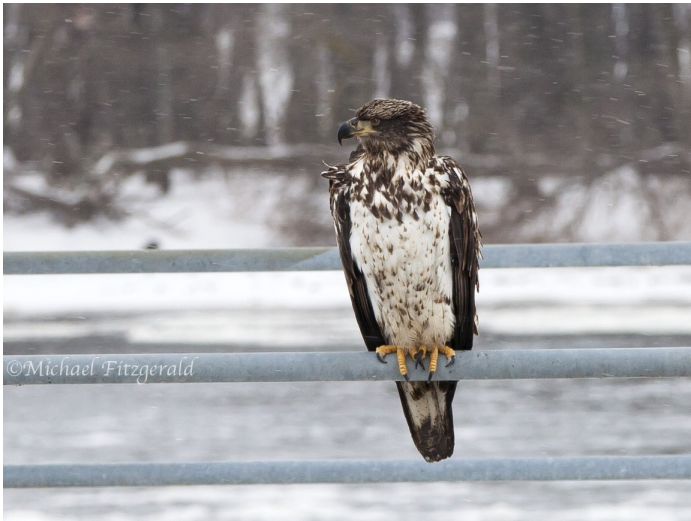
Immature Bald Eagle at Lock and Dam 13