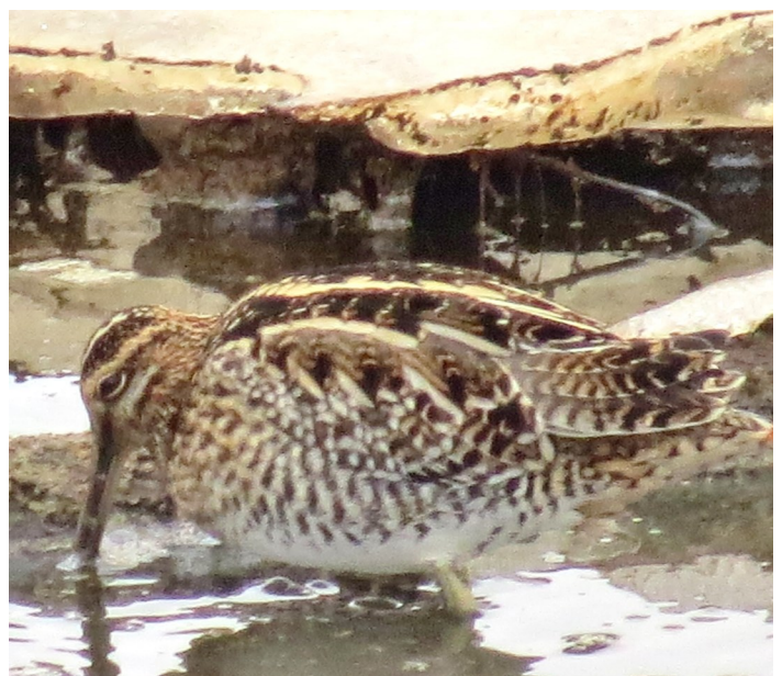
Wilson's Snipe