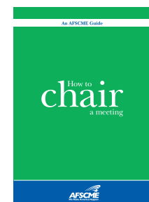
F-77: How to Chair a Meeting (English)