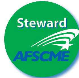
F-27: Steward Button

AFSCME T-Shirts SUBTOTAL C: Please transfer this amount to the TOTALS box on other side