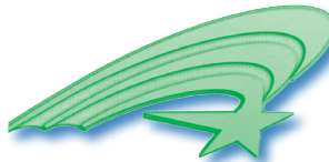
J-30: AFSCME Logo Cutout Pin