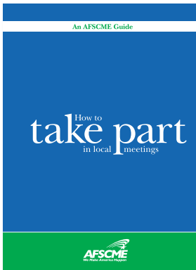
F-73: How to Take Part in Local Meetings (English)