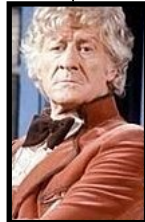
Third Doctor (Jon Pertwee, 1970-1974)

I've got an Ood feeling about this... _____