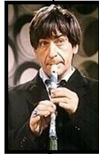
Second Doctor (Patrick Troughton, 1966-1969)

Executed by animated scarecrows as the Time Lords' punishment for stealing the T.A.R.D.I.S.