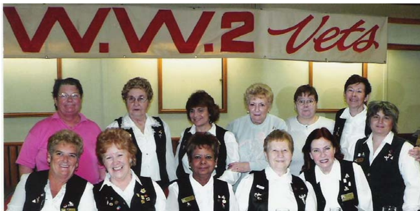
Our hard working Ladies of the Ladies Auxiliary relax after a full day at the Old Sweats Luncheon. Great job Ladies.