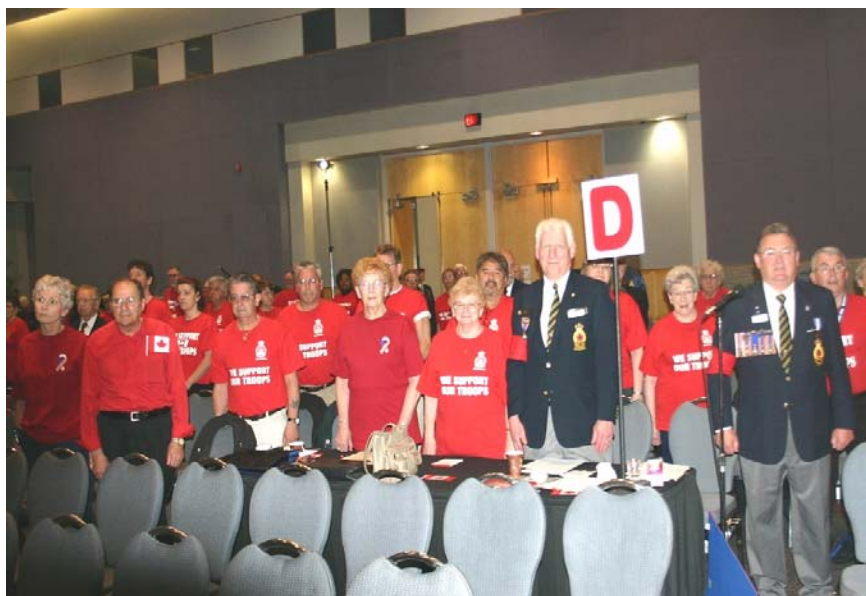
Provincial Convention London Ont. May 12-16/07 Convention delegates show support for our troops.