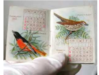
“American Singers” Calendar 1902