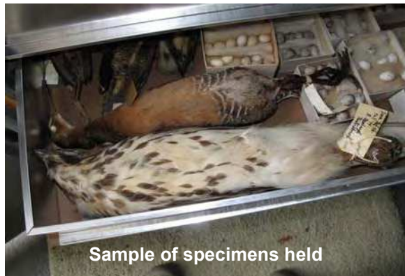
Sample of specimens held