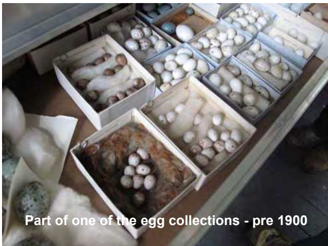
Part of one of the egg collections - pre 1900