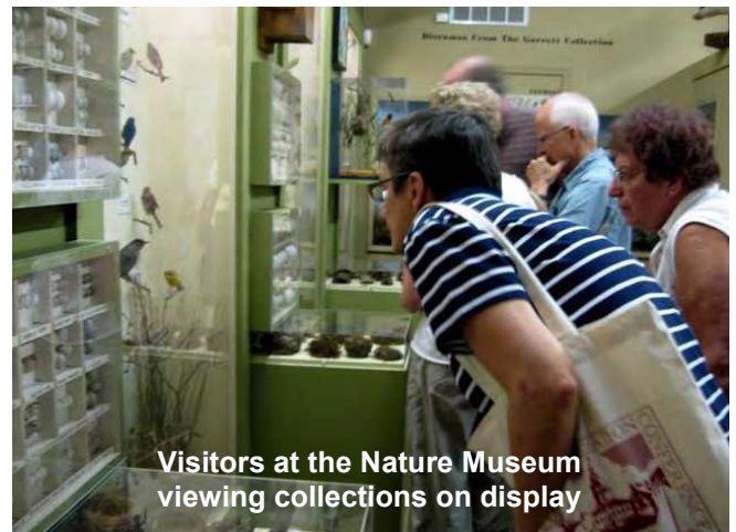
Visitors at the Nature Museum viewing collections on display