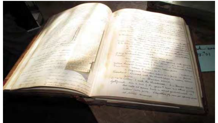
Frank Kirkwood's Field Note Journal

Most of these items currently reside at Cylburn Arboretum but some items are located at MOS sanctuaries. The specimens and journals are available for research and educational purposes, but because there is no catalog or inventory most people do not know of this hidden treasure. This also impedes professional archival management of these collections. One of the biggest problems is that there is no independent humidity or temperature control, although some of the collection is stored in airtight metal cabinets. Light, insects, mold and moisture pose serious threats to the collections. An equally serious problem is that loss of associated data regarding the origin, date, collector, and other information not evident from the item itself could substantially reduce the value of the collection for interpretation.