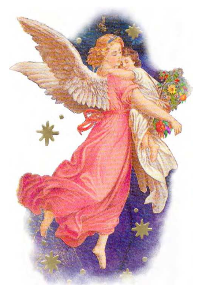
And He Will Raise You Up On Eagle's Wings...

For those who have suffered the loss of a child of any age through miscarriage, still-birth, abortion, SIDS, illness, disease or any untimely death.