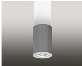
DL Down Light LED MR16 (12V, GU5.3Base)