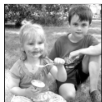
Fun at the Annual Friends Ice Cream Social - YUMMMY!