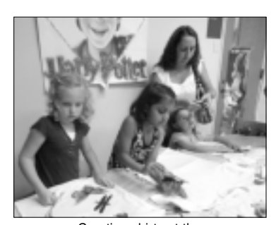
Creating shirts at the "Let's Go to Mexico" program

Thank you to our longtime supporter Farmington Bank and all the following sponsors who helped encourage reading and literacy in our community!