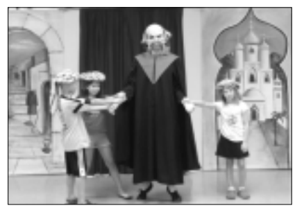
Audience participation in the production of "Aladdin" by the Hampstead Stage Company

Thank you to everyone who participated in our 2011 Summer Reading Clubs- "One World Many Stories!" and "You are Here!" They were hugely successful with over 500 participants ranging in age from 2-18! Reader's participated in library programs, completed great reading goals and tracked their reading on reading logs. They brought their reading logs in weekly for a "check-in" and received rewards and raffle tickets towards larger prizes. Check out some fun from some of our Summer Reading events!