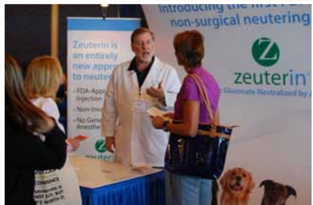
Ark Sciences representatives explain their "Zeuterin" product at the vendor fair.

protocols that can be utilized across our industry. We will be opening registration in December with a special alumni discount for those who participated this year. 🐾