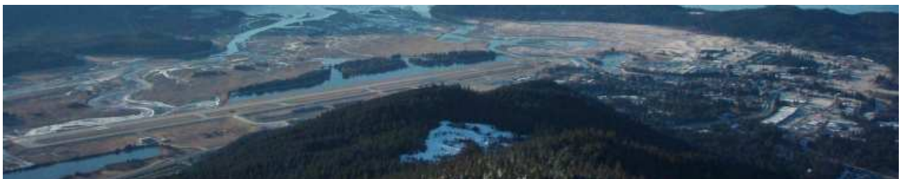
3. Aerial View