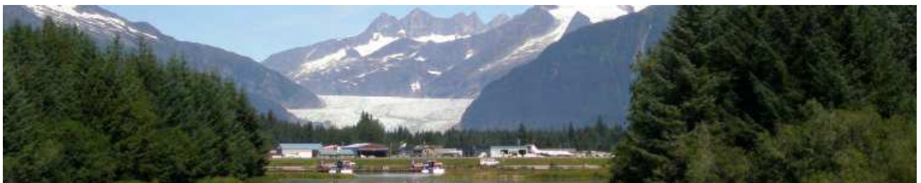
2. Juneau Airport from the south