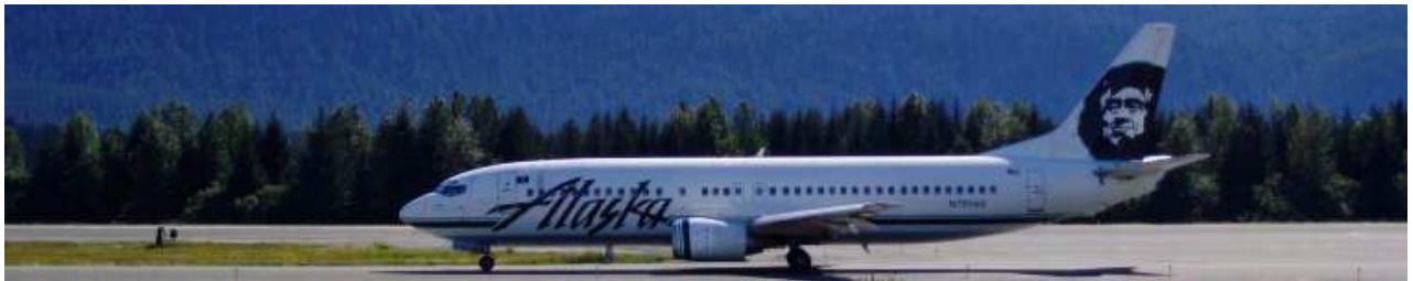
1. Alaska Airlines is the only commercial passenger air carrier operating at Juneau