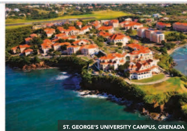
ST. GEORGE'S UNIVERSITY CAMPUS, GRENADA

Forensics From crime scene to laboratory the role of the pathologist in CSI.