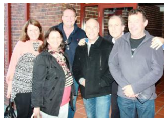
Class of '78