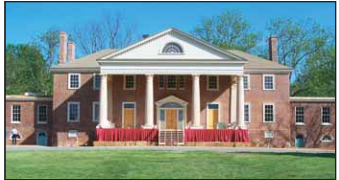
Montpelier restored.