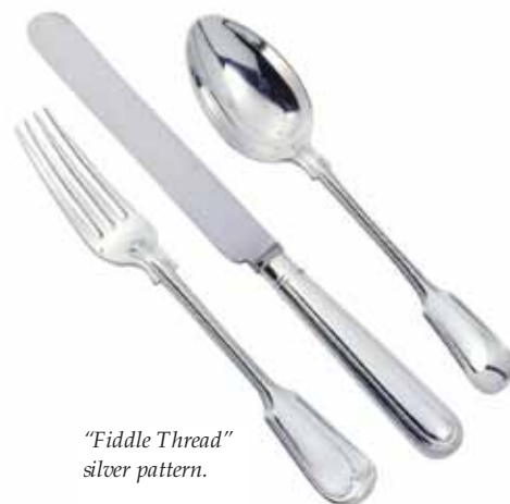
"Fiddle Thread" silver pattern.