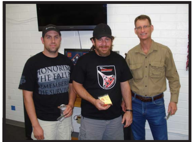
Door Prize winners