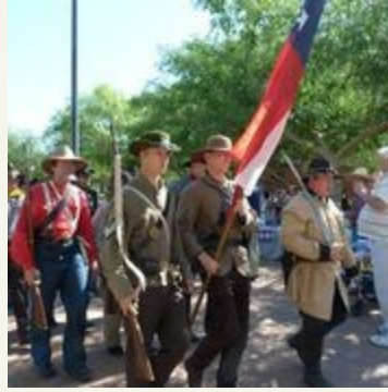
Clockwise: Knights Templar Sons of Union Veterans of the Civil War Arizona Masonic Lodge #2