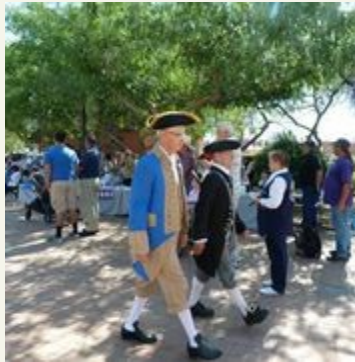
Clockwise: Buffalo Soldiers Arizona Civil War Council Knights Templar