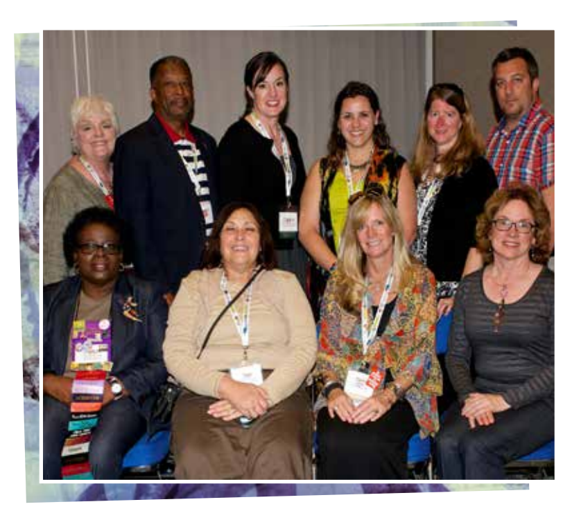
Awards Recipients and Colleagues from the Southeastern Region