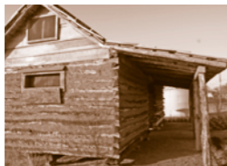
McPherson Park is the newest addition to your park system.

(From Highway 26: west on Glade, north on Bransford and west on L.D. Lockett) Many of the recreation classes are held at the L.D. Lockett House. This four acre park also contains open space area, a gazebo, picnic areas and two horseshoe pits.