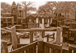
The view from Kidsville Park playground.

Phase 1 of the Cottonbelt Trail is a 2.3 mile multi-user trail that begins at Bettinger/LD Lockett Road and ends at John McCain Road/Highway 26.