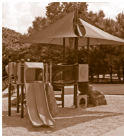
Colleyville Nature Center

(From Highway 26: west on Glade and north on Bransford) Recent recipient of a state turfgrass award, this 40 acre community park features nine lighted baseball and softball fields, six lighted tennis courts, basketball courts, horseshoe pits, concessions/restrooms, covered pavilion, pond, amphitheater and a 1 mile multi-use trail.