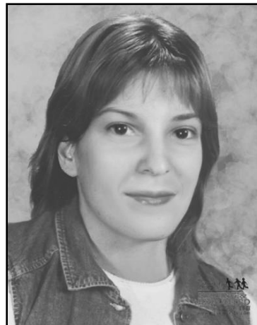
Age Enhanced Photo

Female, Age Now: 28 Hazel eyes, Brown hair