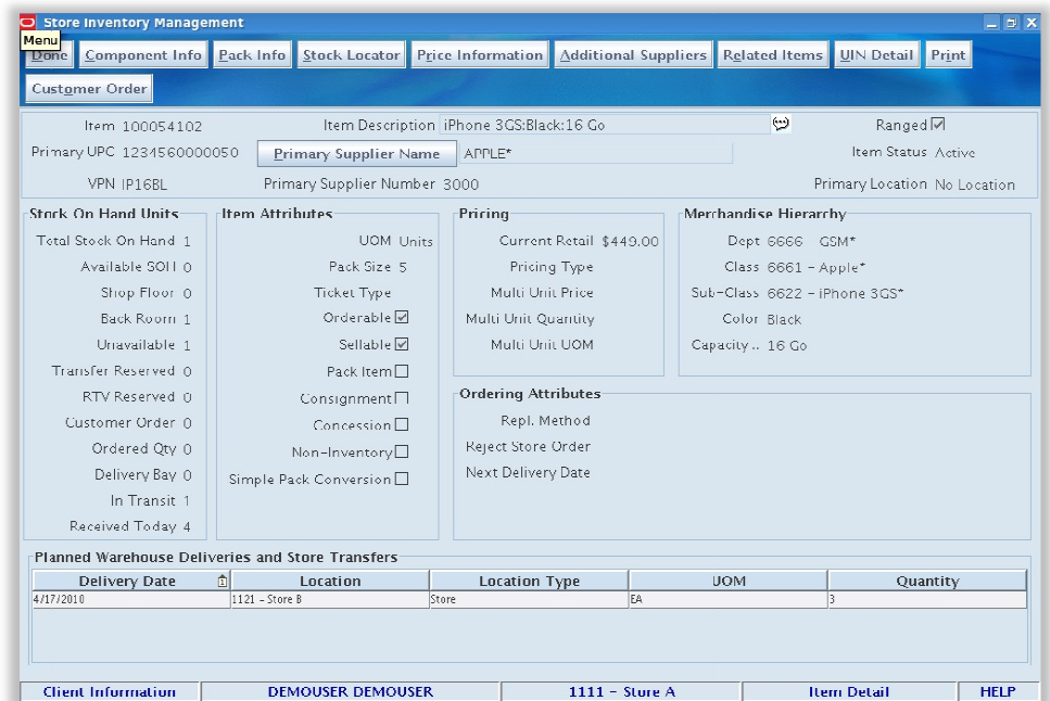
Figure 1. Oracle Retail Store Inventory Management Stock Item Detail

Oracle Retail Store Inventory Management can provide inventory position visibility, streamline in-store activities, improve merchandise management and productivity, reduce labor costs, support remote store processes, and manage store-level profit and loss. Using a high-speed internet connection and portable handheld wireless devices, store managers and store personnel can now quickly and easily perform an array of in-store operations, including receiving merchandise, managing physical inventories, conducting stock counts, ordering merchandise, and transferring stock.