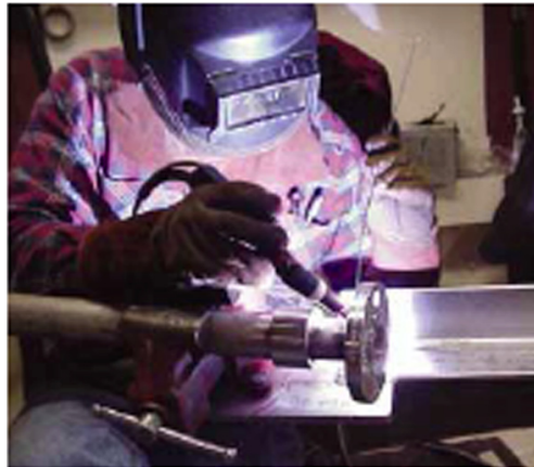
An employee welds a stainless steel flange using a tungsten inert gas (TIG) welding process.