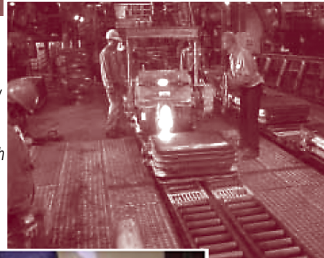
Filling molds in a foundry