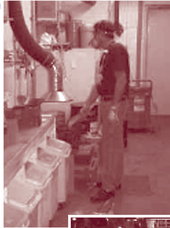
Weighing Cr(VI) pigment for colored glass production