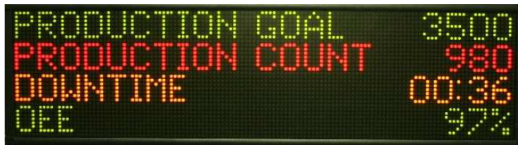
Production Marquee (Part # PM-0420-T)

DataVisor Marquees has built the Production Marquee Series that combines a visual display with ethernet communications, digital I/O, and web server technology integrated into one self contained package. With no software to install and the data source formulas programmed into the marquee, all you have to do is select the functionality of the application from drop down menus. Setup and monitoring of this real time production data is as simple as opening a web browser and entering the IP address of the marquee display. Imagine real time plant floor production data monitored and collected anywhere within your facility. Just supply two inputs, enter your target counter value and cycle time and the Simple OEE calculation is displayed, monitored, and collected by simply choosing OEE as the data source. Additionally, you can select your Goal, Break Schedule, and other Production Data Sources that are important to view and monitor from your production process.