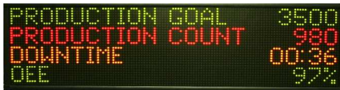
Production Marquee (Part # PM-0420-T)

DataVisor Marquees invites you to take the time to read this guide to understand Simple OEE and how to implement this tool in your facility. After reading our "Complete Guide to Simple OEE" you will have a better understanding of Simple OEE and how we can help you visualize, monitor, and collect OEE data in your plant with the Production Marquee.