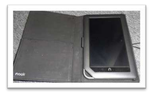
The District purchased two Nooks – Only one has been returned