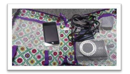
The District purchased two IPods - Only one has been returned

E. Our investigation revealed that the following equipment was missing from the district: an IPod Touch ($283.47), a Bosch Pro Drill ($35.05), and a Nook ($259). Furthermore, we could not determine if the listed purchases were business related. The former director advised that the IPod Touch was at her residence. This IPod Touch has not been returned to the district.