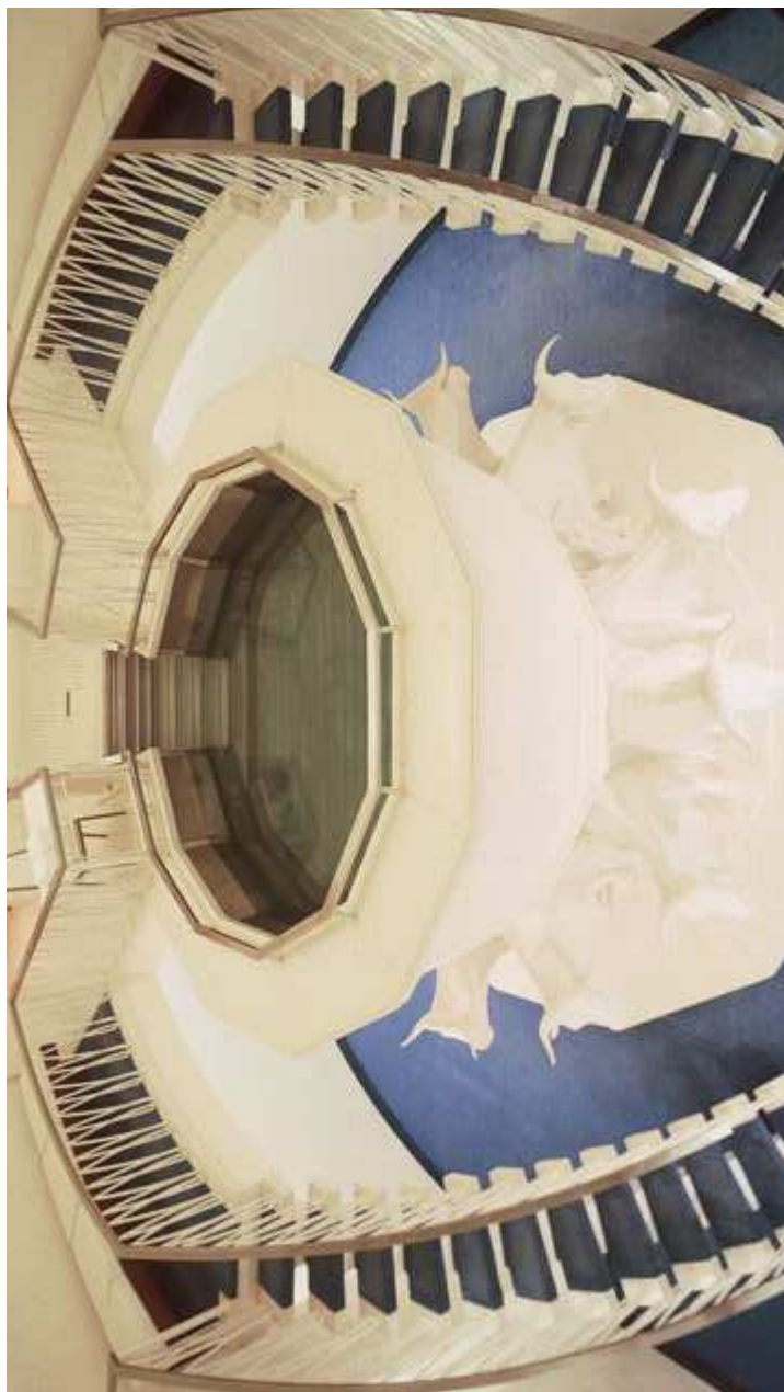
Baptistal Font, Washington D.C. Temple