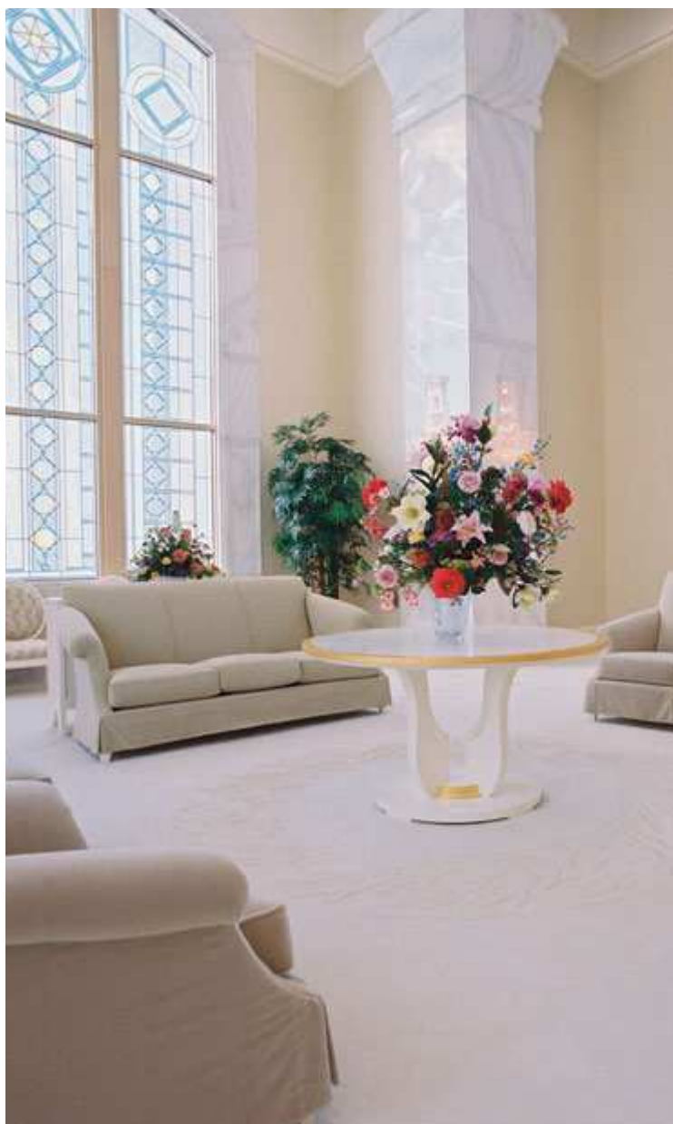
Celestial Room, Columbia River Washington Temple