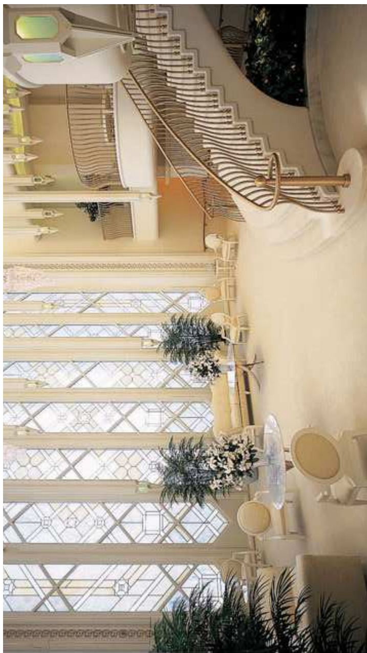
Celestial Room, San Diego California Temple