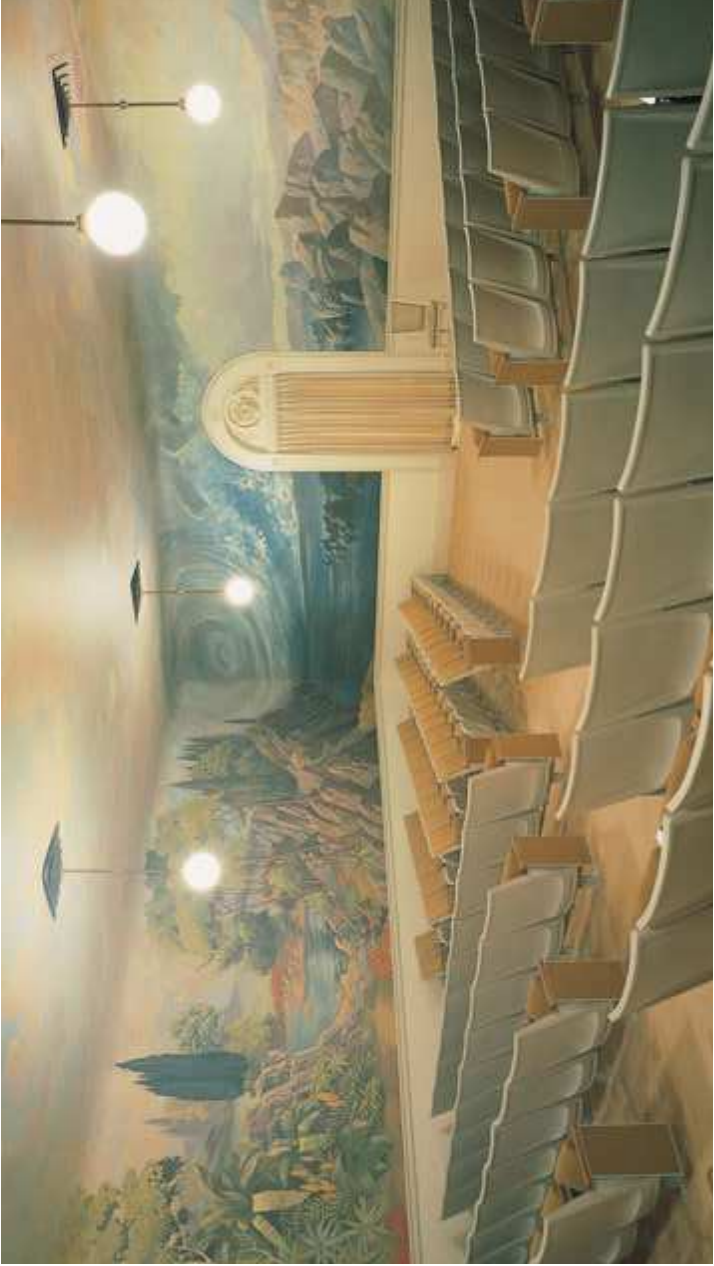
Creation Room, Salt Lake Temple