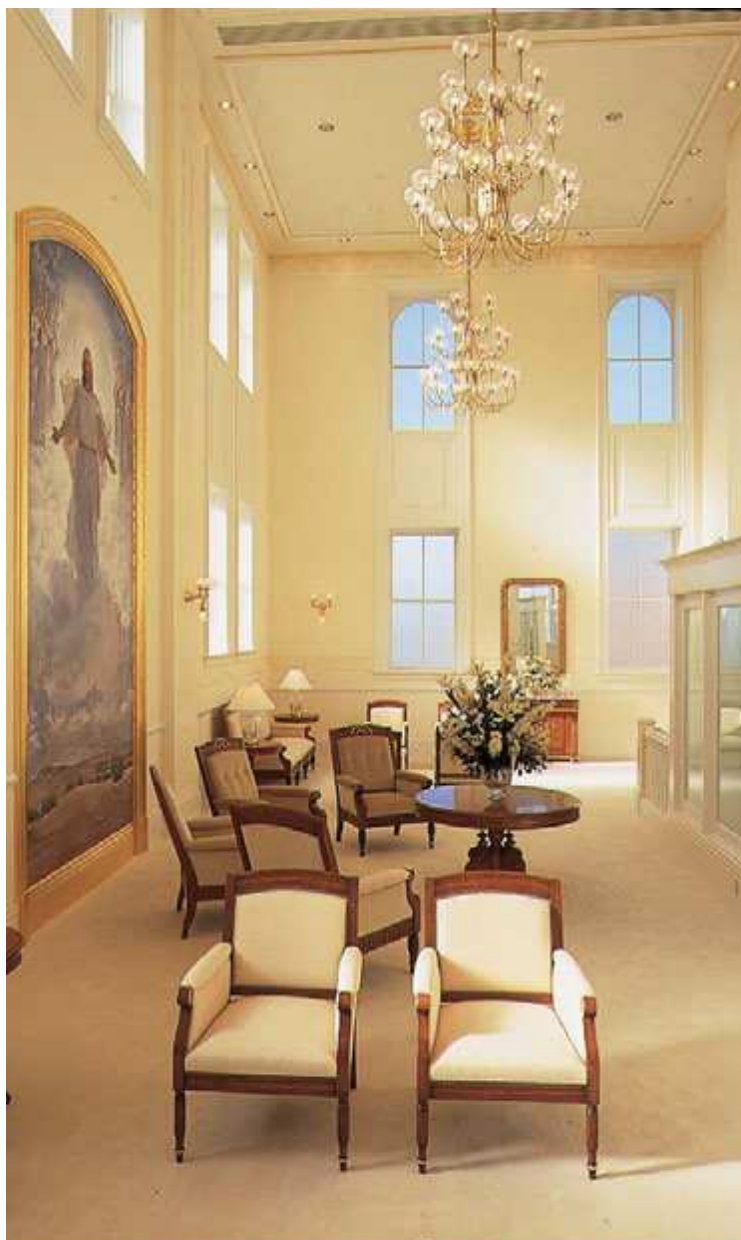
Celestial Room, Vernal Utah Temple