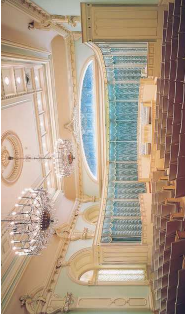
Terrestrial Room, Salt Lake Temple