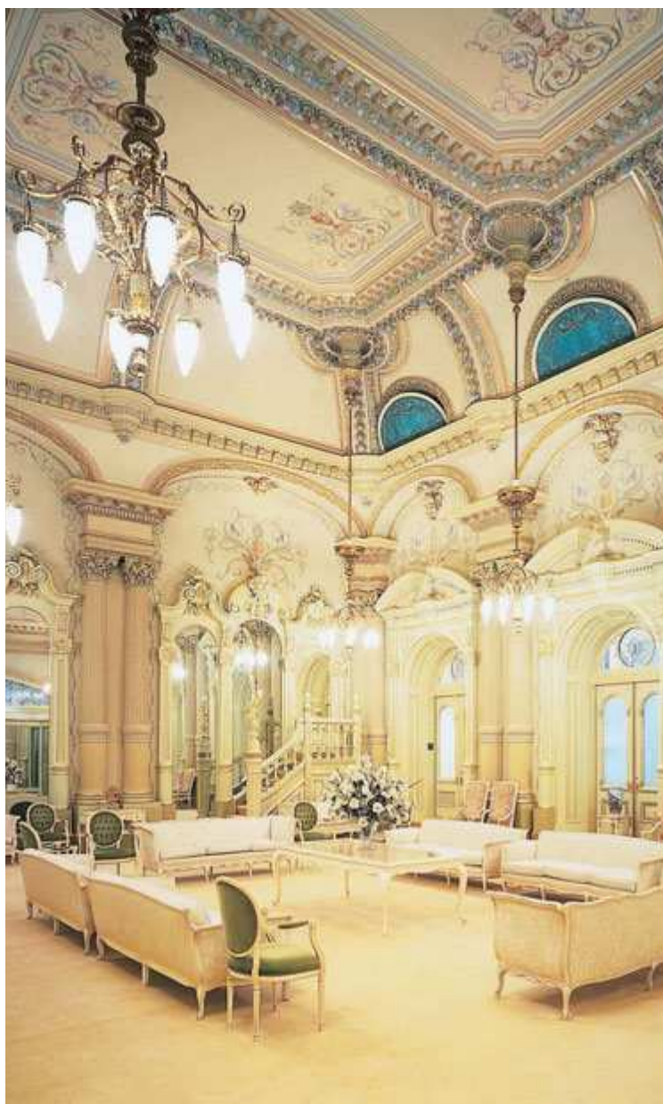
Celestial Room, Salt Lake Temple