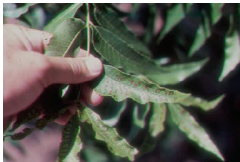
Figure 1. Zinc deficiency causes brown spots between leaf veins.