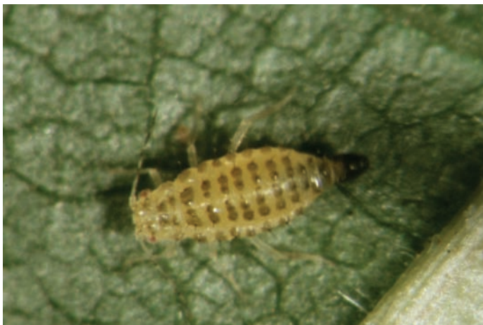
Figure 7. Yellow pecan aphid ( Monelliopsis pecanis (Bissell))