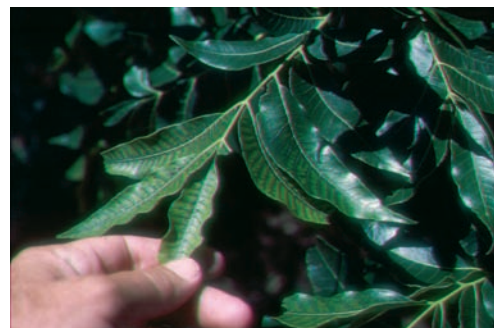
Figure 3. Zinc deficiency causes small leaflets.

cases has to be sprayed on foliage as a supplement to soil application. Spraying may be difficult with large trees or prohibited by cost, necessitating soil applications. The zinc source for spraying is zinc sulfate (36% zinc), or liquid zinc nitrate (17% zinc). Some liquid zinc formulations are sold that also contain liquid iron. DO NOT use zinc chelates as a zinc source for foliar or soil applications. Chelates are low in zinc (about 7-10%), and expensive. Chelates are not recommended because they do not supply enough zinc to satisfy pecan tree requirements. In addition the chelated molecule is large and is not absorbed very well by leaves and/or roots.