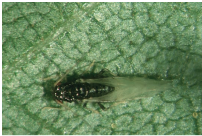
Figure 8. Black pecan aphid ( Melanocallis caryaefoliae (Davis))