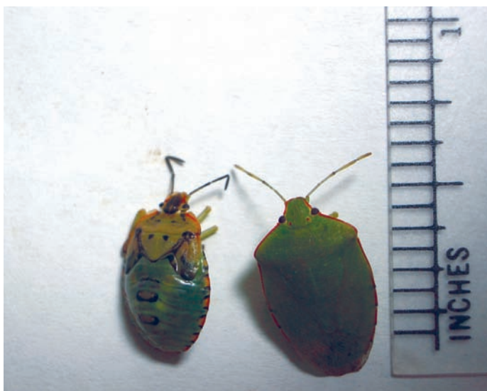
Figure 9. Stink Bugs