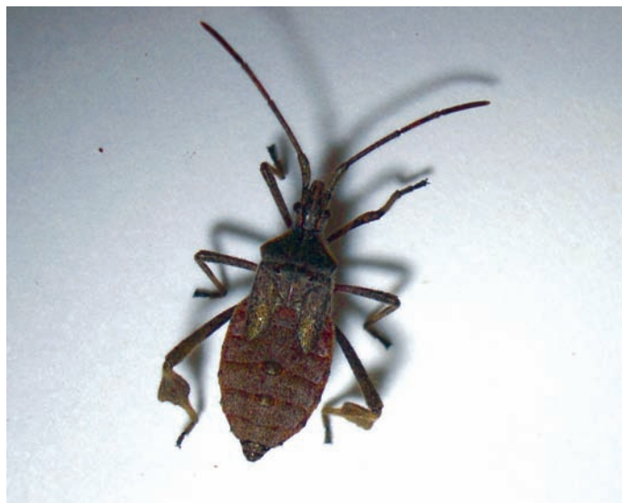
Figure 10. Leaf-foot Plant Bug