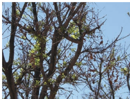
Figure 2. Severely zinc deficient tree.