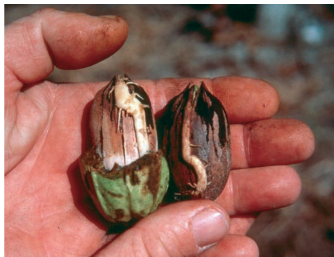
Figure 6. Vivipary or pre-germination

viviparity, such as ‘Cheyenne’ and ‘Pawnee’. With varieties with potential vivipary problems in the low desert areas, like “Wichita” and “Western Schley”, try harvesting the nuts just after the kernel matures but before germination begins. These nuts are harvested early before they have a chance to dry naturally on the tree and are called “green harvested” nuts. They will need to be removed from their husks and dried separately to prevent mold and mildew from forming on the nut shells.