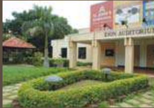
Zion Auditorium - Media Center