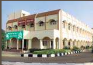
Apollo Hospital & Veg. Dining Block

Languages Offered : French, Thai & Mandarin