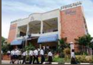
Hebron Hall - Indoor Stadium

Groups in XI & XII : Science, Commerce & Humanities