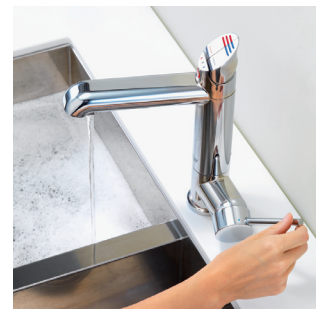
PLUS hot, cold or warm