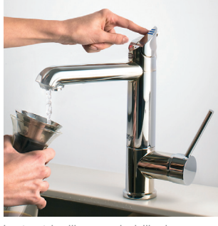
Instant boiling and chilled filtered water

Boiling and chilled filtered drinking water, instantly, PLUS hot, cold or mixed warm water – All from the one tap!