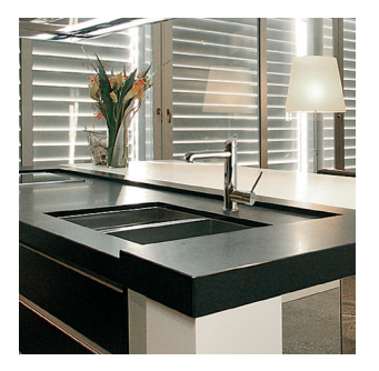
Simplifies kitchen design