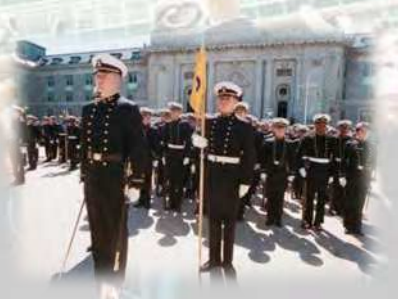
U. S. Naval Academy Annapolis, Maryland

U. S. Merchant Marine Academy Kings Point, New York