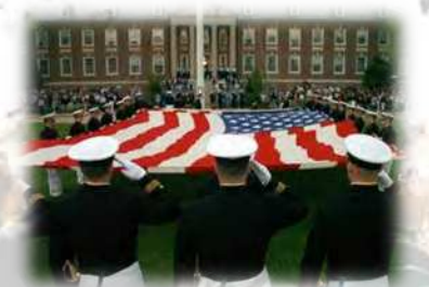
U. S. Coast Guard Academy New London, Connecticut

U. S. Military Academy West Point, New York