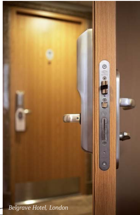
Belgrave Hotel, London

A new modular approach also gives unparalleled flexibility to fulfil both a hotel's design and cost parameters.