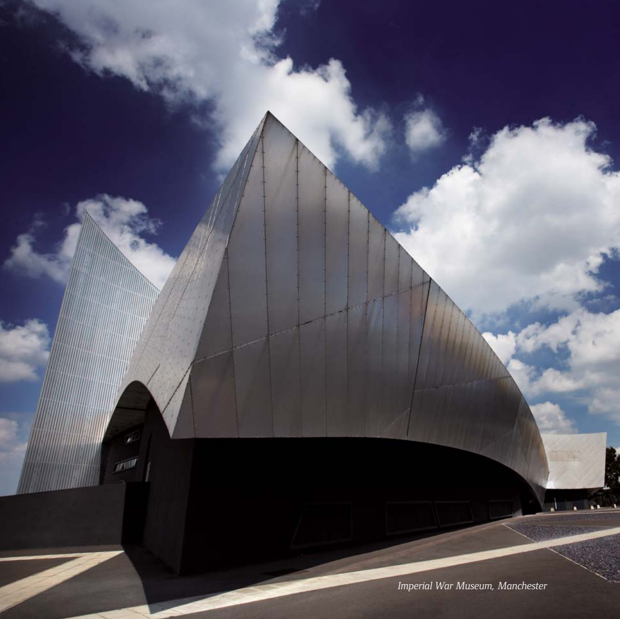
Imperial War Museum, Manchester