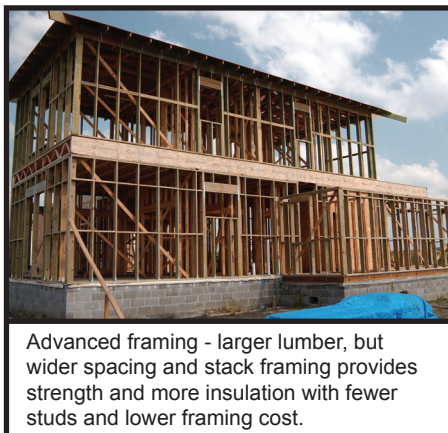
Advanced framing - larger lumber, but wider spacing and stack framing provides strength and more insulation with fewer studs and lower framing cost.