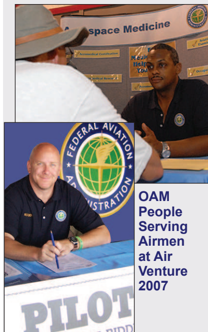
OAM People Serving Airmen at Air Venture 2007