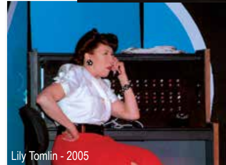
Lily Tomlin - 2005