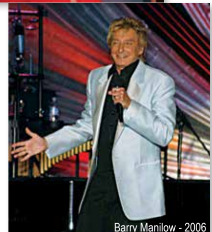
Barry Manilow - 2006