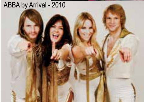
ABBA by Arrival - 2010