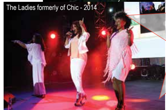
The Ladies formerly of Chic - 2014