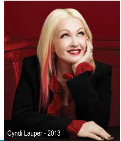
Cyndi Lauper - 2013

Your support becomes ever more critical to our success as we continue to help meet the nutritional needs of our clients.