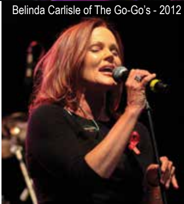
Belinda Carlisle of The Go-Go's - 2012