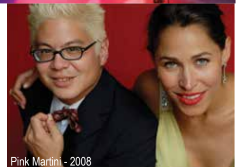
Pink Martini - 2008