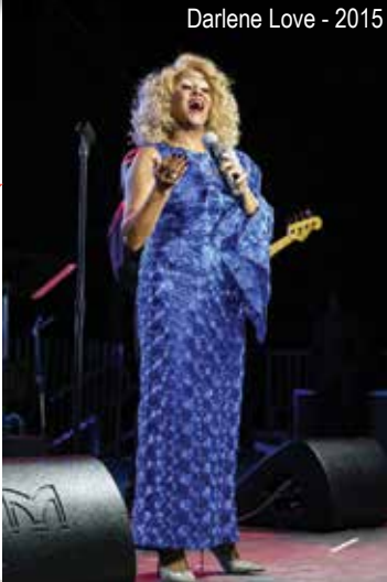
Darlene Love - 2015