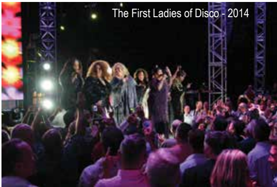
The First Ladies of Disco - 2014