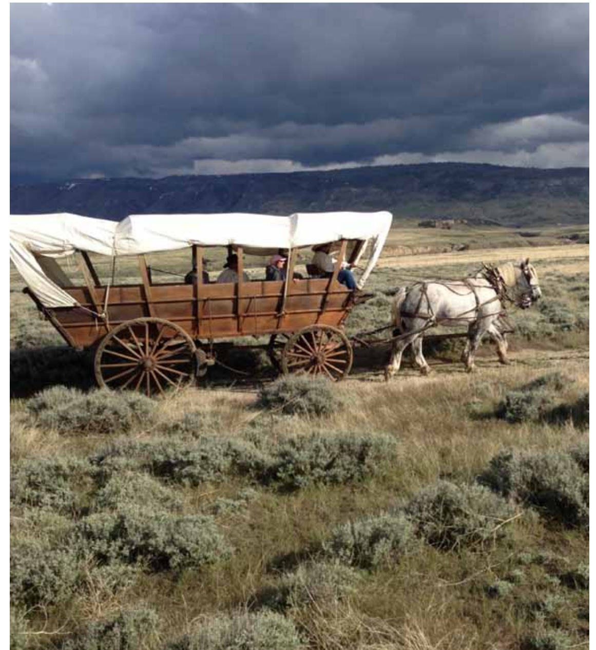
A historic wagon follows the Oregon Trail as it crosses Casper Alcova Irrigation District lands in Wyoming.