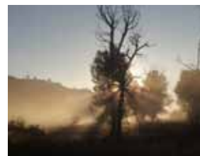
Front cover: An October view taken between Huntley Project and Pompeys Pillar in Montana.