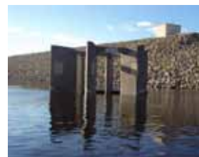
Back cover: Shadehill Dam, South Dakota, reservoir and outlet.