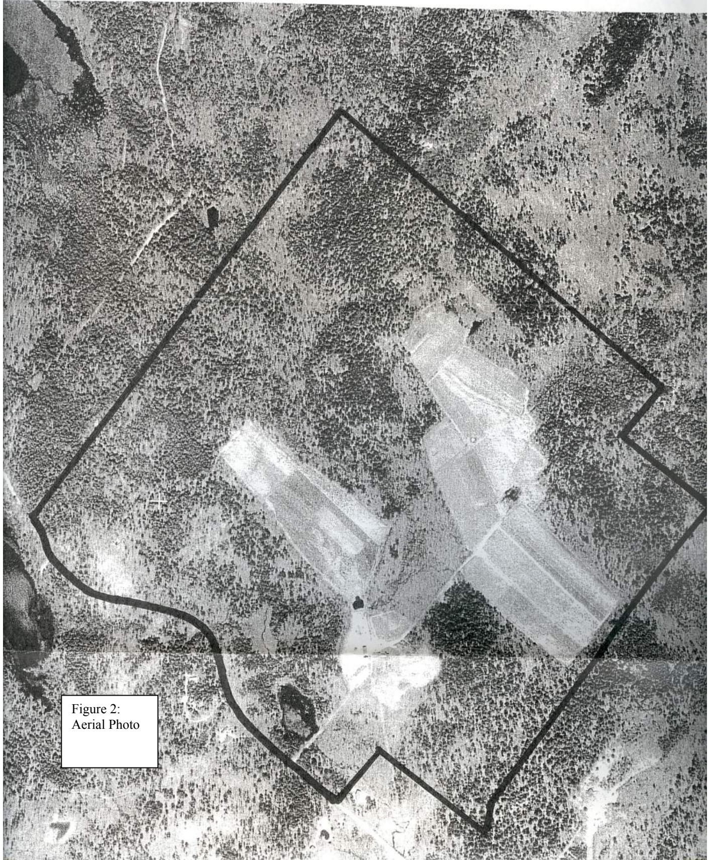
Figure 2: Aerial Photo