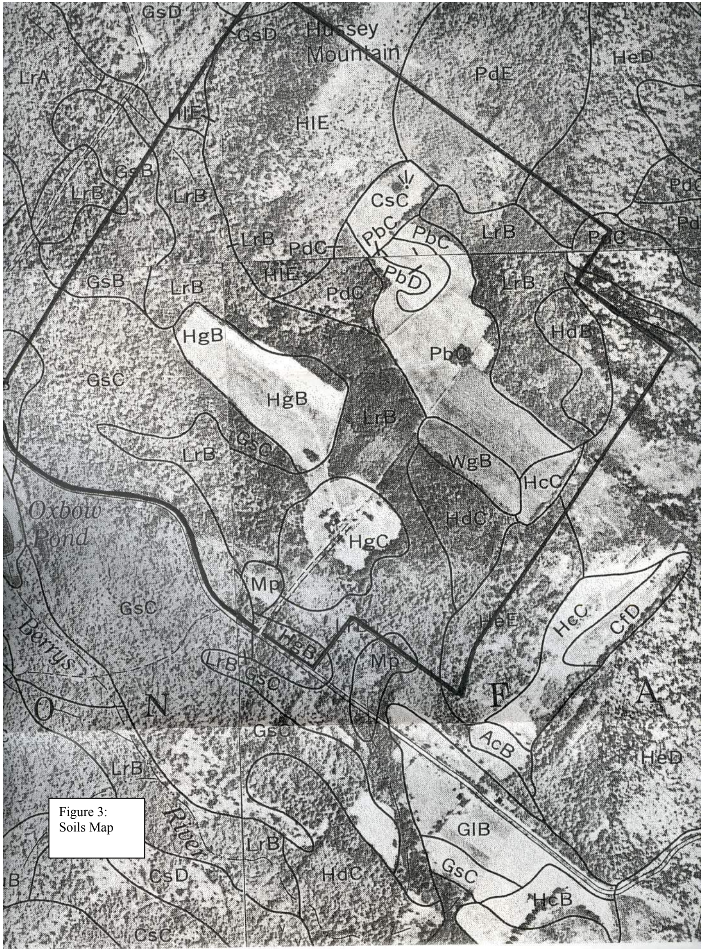
Figure 3: Soils Map