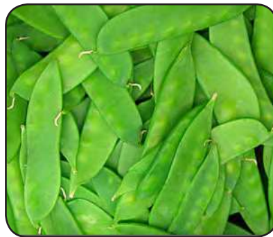
Snow peas are flat, and you can also eat the whole pod.