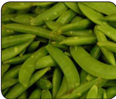
Sugar snap peas are fat and round, and you can eat the whole pod.