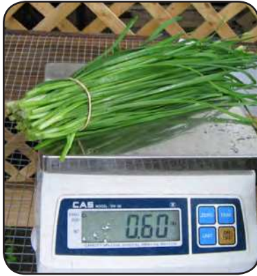
This bunch is too big!