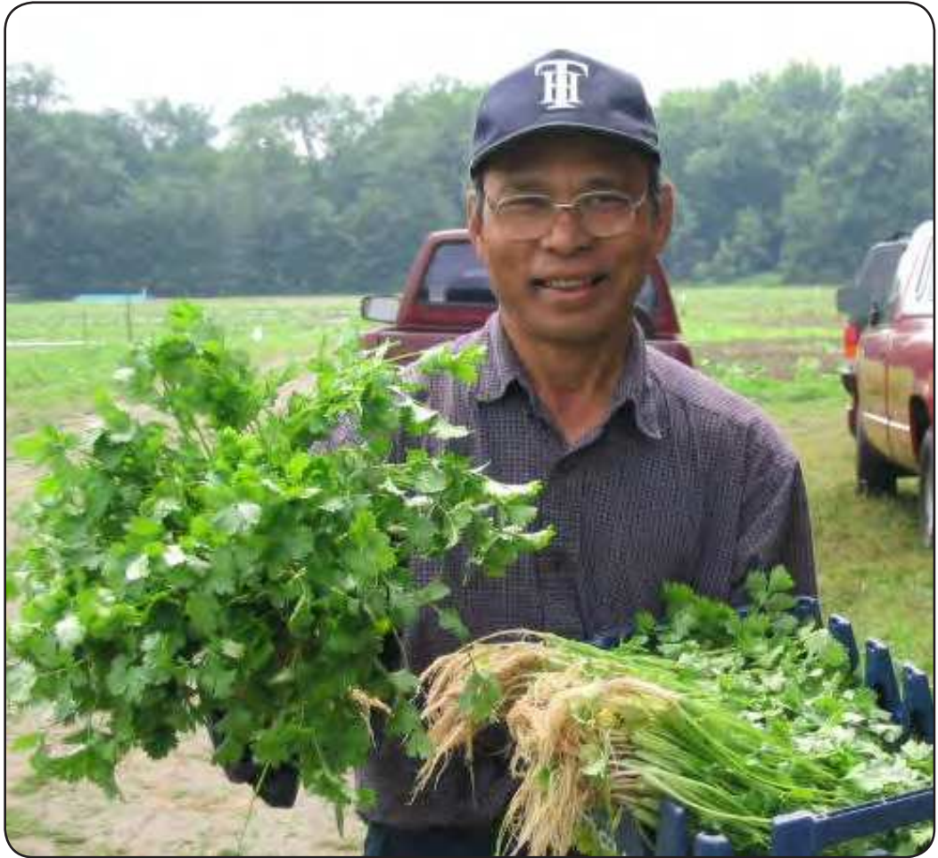
Harvesting Crops For Market