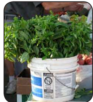
Bunches of basil at market.