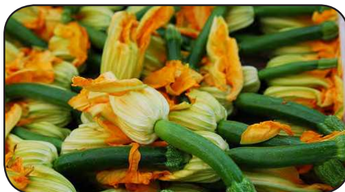
Female Blossoms (on fruits)