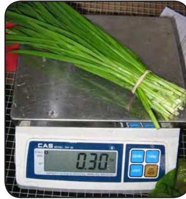
Keep bunch sizes small.