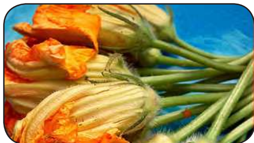
Male Blossoms (long stems)