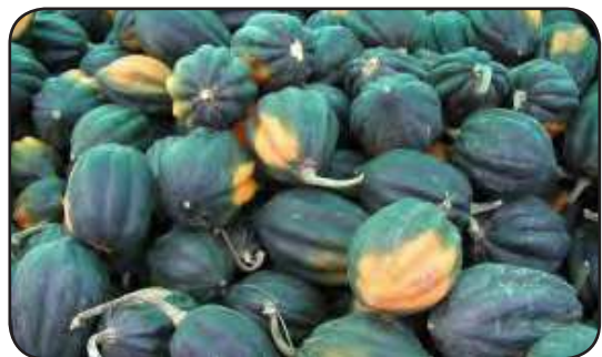
Acorn Squash: Orange spots mean they are ready to harvest.