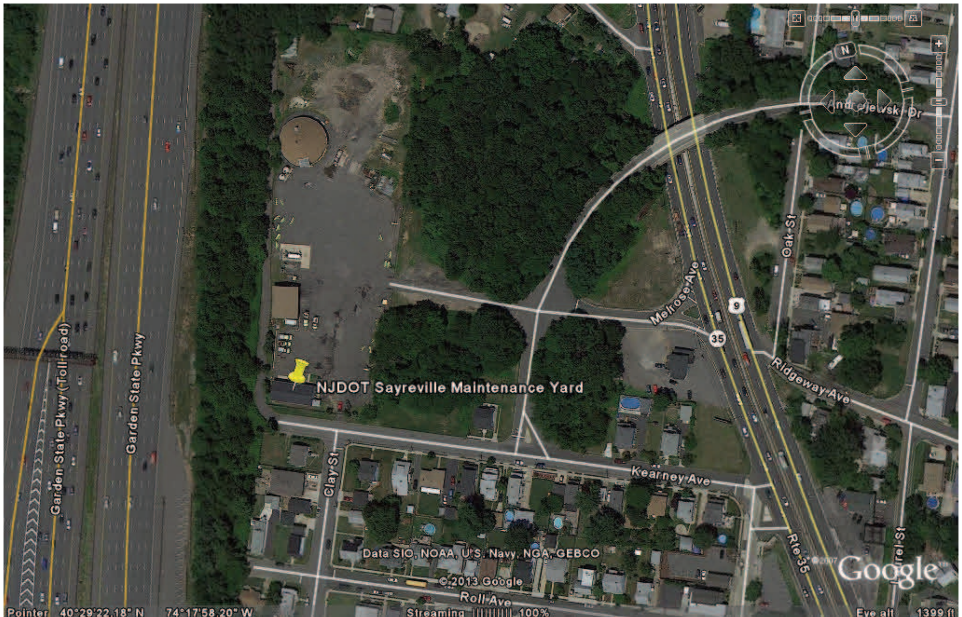
NJDOT Sayreville Maintenance Yard Location Map EXHIBIT 'B'