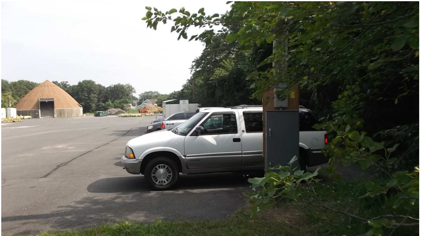
Anticipated new trailer area uphill from leased trailer. EXHIBIT 'D'