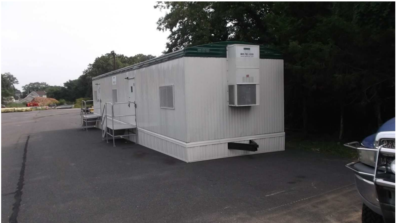
Existing leased trailer. EXHIBIT 'D'