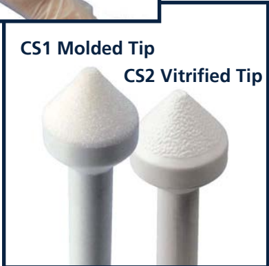
CS1 Molded Tip

CS (closed system) tissue grinders are designed for safety.