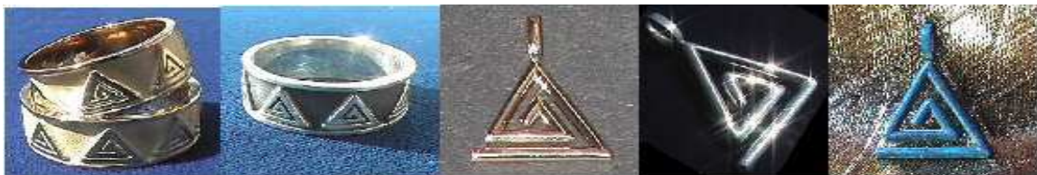
(U) BLogo jewelry