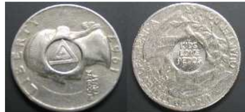
(U) BLogo imprinted on coins