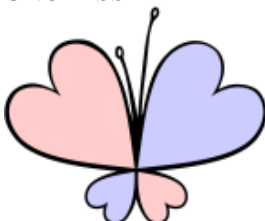
(U) CLogo a.k.a. "Child Lover"