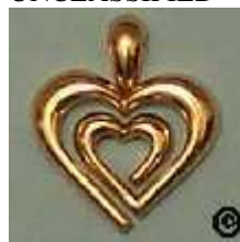
(U) GLogo Pendant

(U) The ChildLover logo (CLogo), as shown below, resembles a butterfly and represents non-preferential gender child abusers. The Childlove Online Media Activism Logo (CLOMAL), also represented below, is a general purpose logo used by individuals who use online media such as blogs and webcasts. 4