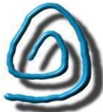
(U) LBLogo aka “Little Boy Lover”