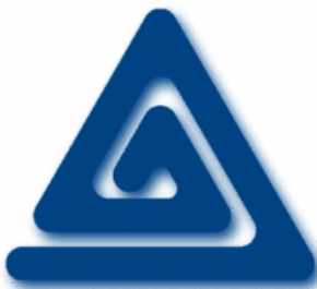
(U) BLogo aka “Boy Lover”