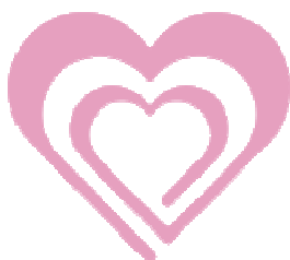
(U) GLogo a.k.a. "Girl Lover," Childlove