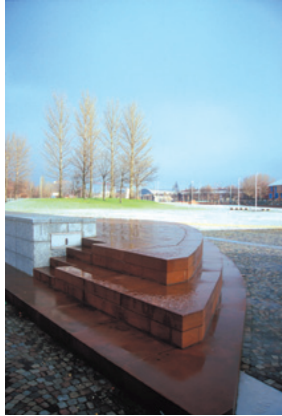
Landscape Projects, 1999