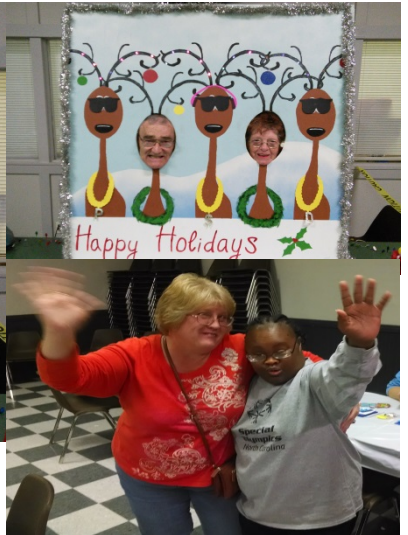
Participant Photo Gallery....Who do You Know?