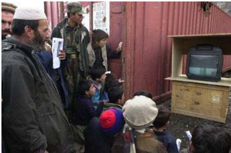
Figure 2: TPT 921 Showing PSYOP Video in Tadokhiel Afghanistan. Source Mike Eckel, “U.S. Military Turns to Video of 9/11/01 to Win Hearts and Minds of Afghans,” Associated Press. See http://www.psywarrior.com/afghanvideo.html

mission, 77 was key to overcoming the limitations imposed by having inadequate equipment for the task. Applying this imperative, the 82 d Airborne Division purchased needed equipment through commercial sources to create a video dissemination system in order to reach the TA with PSYOP video. A gas-powered electric generator and television set comprised the makeshift system. The Division G4 (Logistics) purchased equipment for four systems, which were distributed to the TPTs.