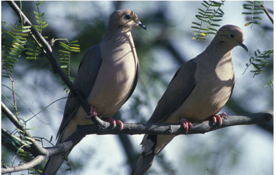
George Andrejko / Arizona Game & Fish Department

The goal and objective of this plan will be fulfilled when (1) harvest management strategies are developed and management plans prepared for each of the 3 management units that include decision criteria that explicitly state when regulatory changes will be made, what the changes will be, and the estimated effect of regulatory options, and (2) harvest management strategies, decision criteria, regulatory changes, and estimated effects are based on an understanding of current harvest and demographic parameters and their relationships.