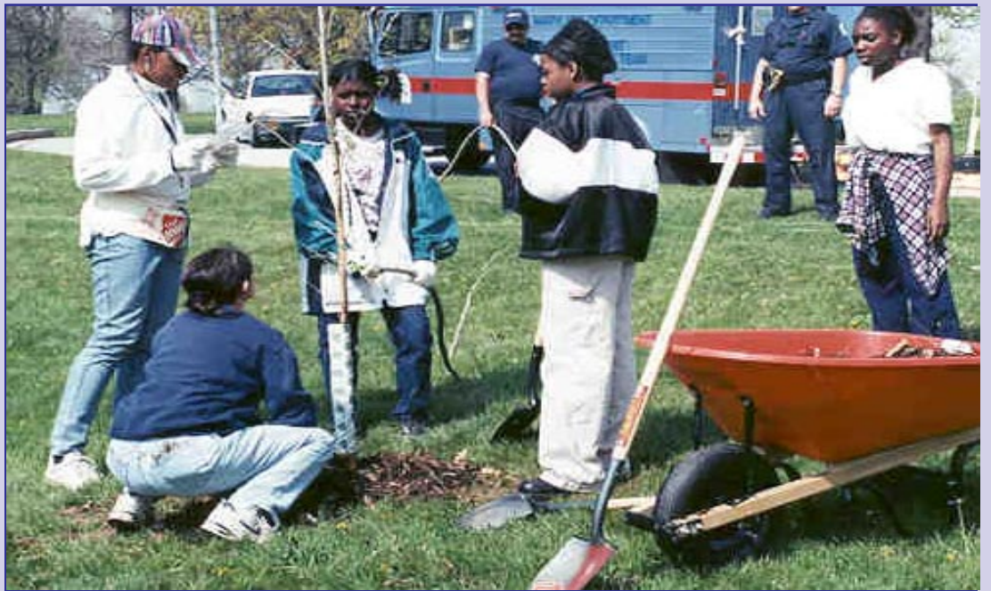
Highlandtown Middle School students and MDE employees planted saplings and learned the value of trees to the environment.