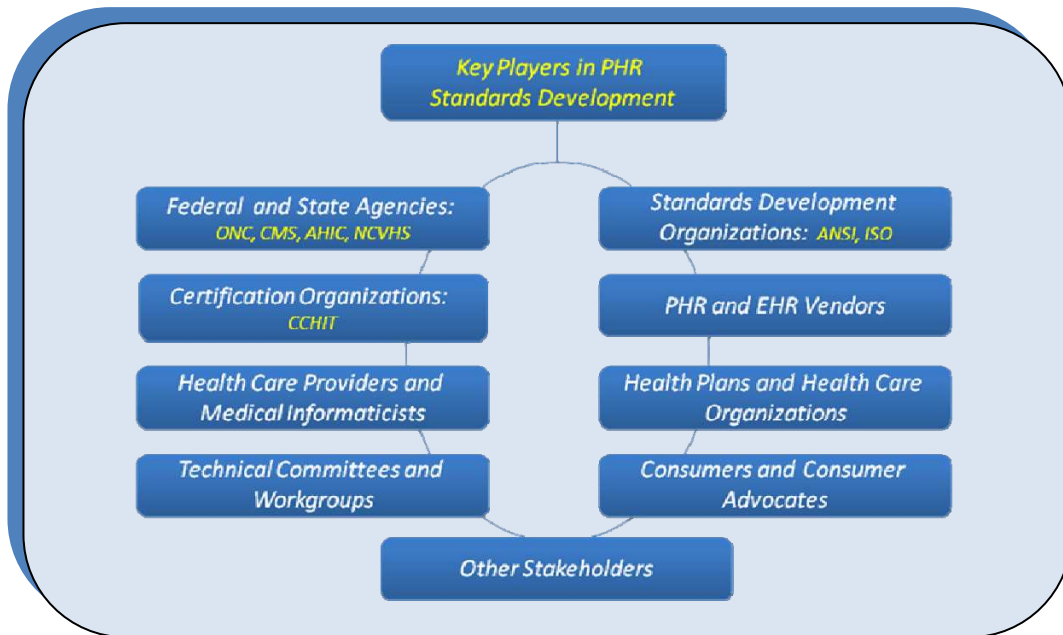
EXHIBIT 5 KEY PLAYERS IN PHR STANDARDS DEVELOPMENT

standards development community, and other leading organizations in the PHR space. Exhibit 5 provides an overview of the major entities involved in standards development for PHRs. A brief description of key players and their respective roles are provided below.