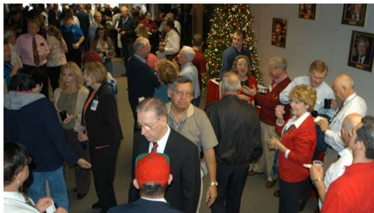
EMPLOYEES AND retirees enjoy the Dec. 6 Holiday Coffee in the lobby of the Headquarters Building. See pages 4 and 5 for more photographs of the event.

Employees on the third shift were treated to holiday treats on Dec. 5 in the lobby of the Launch Control Center.