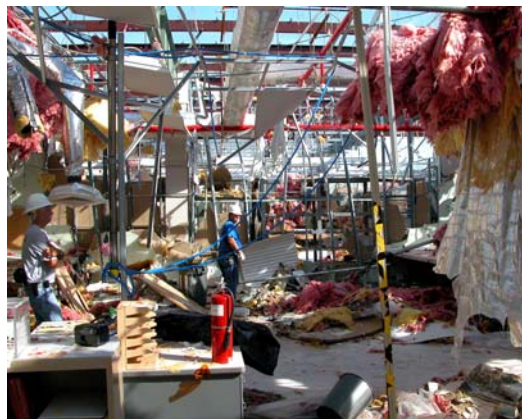
EMPLOYEES MOVE a blanket sewing machine (above) into the Thermal Protection System facility that has recently been repaired. The upper floor of the facility, where soft material was processed, was damaged during the 2004 hurricanes (left).

als are made on the facility's ground level, which experienced water intrusion during the storm. Although some of the offices flooded, tile machining, coating and firing equipment weren't harmed and manufacturing operations continued.