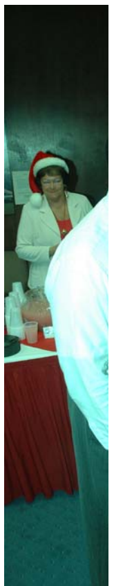
DEPUTY DIRECTOR D. Launch Services Program meeting employees on the event.