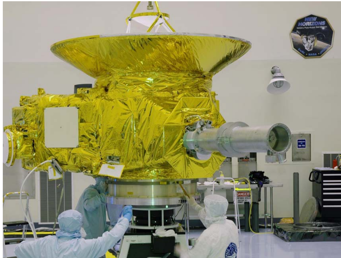
IN KENNEDY Space Center's Payload Hazardous Servicing Facility, workers secure the New Horizons spacecraft onto a spin table. The spacecraft will undergo a spin test as part of prelaunch processing.

The Launch Services Program at KSC is responsible for government engineering oversight of processing and space craft integration, and launch day