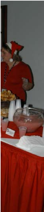
... refreshments to an