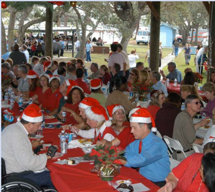
Last year's holiday dinner and celebration at KARS I. This year's event takes place Dec. 16.

The NASA Kennedy Space Center civil service traditional holiday dinner and celebration will be held from 11:30 a.m. to 3 p.m. Dec. 16 at KARS I. Tickets are will be available online until Dec. 14 at http://www.holidaydinner.ksc.nasa.gov .