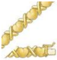
Hugs & Kisses