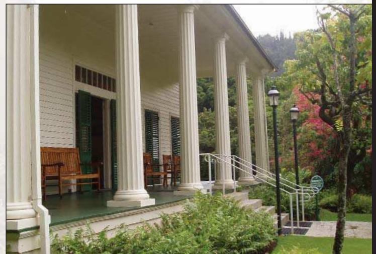
Queen Emma Summer Palace

This unique event allows the residents of Liliha to connect with the beautiful buildings that add to the charm and historical value of this special community. The tour will begin at the Community Church of Honolulu and a trolley will take participants to several organizations in historical buildings where they can gain cultural and historical knowledge of their community while enjoying live music, pupus and refreshments. The possibility of a Horse & Carriage and period costumes is being explored in an effort to enhance the experience of this wonderful event. We want to thank the following organizations that are involved in the tour: American Cancer Society, Girls Scouts, Queen Emma Summer Palace, Philippine Consulate and Taipei Economic & Cultural Office. We look forward to seeing you on February 2nd for the first annual Liliha-Nuuanu Candlelight Tour! To register for the tour, fill out and send in the form located on the back page. For more details, please call 586-9415. Thank you.