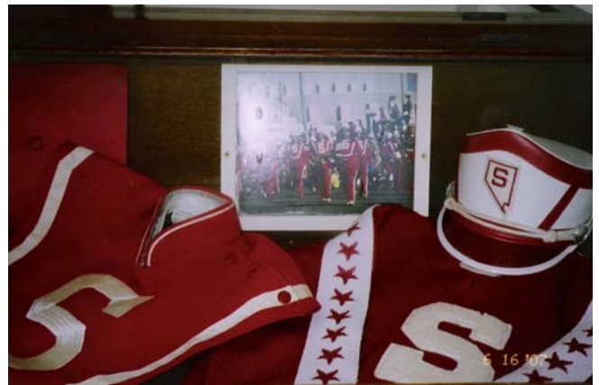
Display of Stewart Indian School Memorabilia at the Stewart Father's Day Powwow