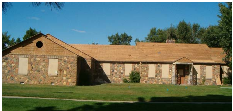
One of the Stewart Buildings Receiving a New Roof