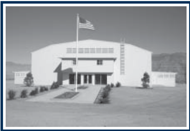
Landscaping in January 2009