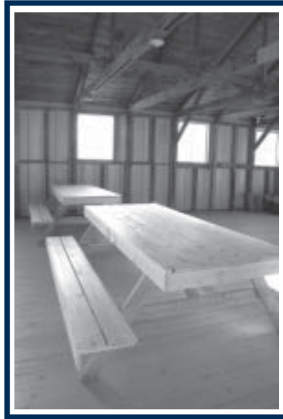
New Mess Hall Tables

As a friend of Manzanar, you will play a vital role in helping others understand this little-known chapter of American history. The National Park Service plans to rebuild elements of Block 14 (one of the camp's 36 residential blocks) to show how Japanese Americans lived, worked, and endured at Manzanar. Restoration of a mess hall is nearly complete, but funding is needed to rebuild barracks, latrines, and other structures which were removed from Manzanar after the war. Your generous donation to Friends of Manzanar will directly support NPS preservation and reconstruction efforts and help this and future generations understand the lessons and relevance of Manzanar today.