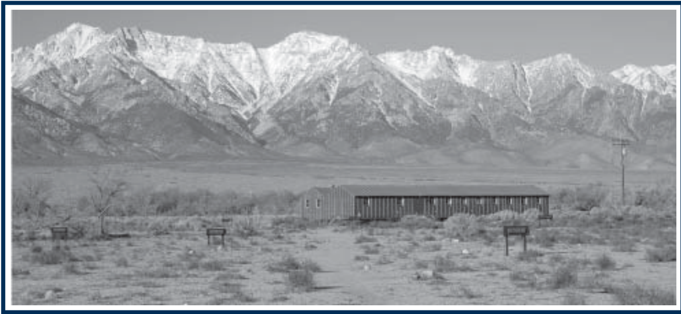
Block 14 in January 2009